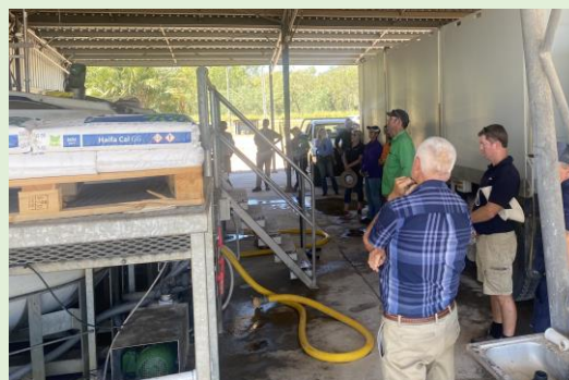
The BBIFMAC AGM was followed by a field visit to Rapisarda's fertiliser mixing plant.

The meeting was followed by a field visit to Rapisarda's fertiliser mixing plant to demonstrate the set-up and practicalities of fertigation in horticulture crops.