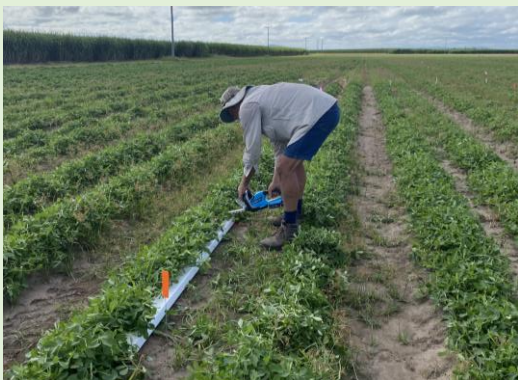
CQU and BBIFMAC staff conducted a biomass harvest of the peanut crop in Home Hill.

Half of the trial plots were cut, and the remainder were left uncut, to determine the effect of this practice on the peanut development. The cut biomass was weighed, dried, and sent down to the team at CQU for detailed nutrient analysis and to determine its suitability as fodder.