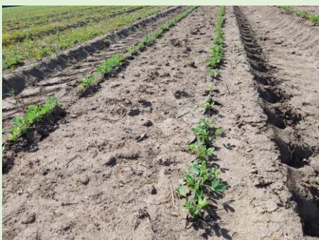
Emergence of the peanut crop in Home Hill.

A new project led by Central Queensland University (CQU), with funding from the CRC for Northern Australia (CRCNA) is the Grain and Graze: Dual purpose peanuts for Northern Australia. This project will assess new peanut varieties as dual purpose crops for kernel yield in combination with different fodder production options in five locations across Northern Australia. Locally, BBIFMAC are assisting with a small plot trial of three varieties in Home Hill.