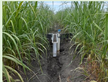
Flumes and water depth loggers have been installed at each of the four sites to determine the proportion of water lost to runoff in irrigations.

BBIFMAC have been engaged as an independent organisation to undertake the water quality monitoring for the project. There are currently four sites with which BBIFMAC are involved.