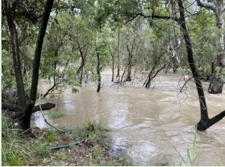
BBIFMAC staff collected manual samples to compare with the in-situ sensors at many of the Fine Scale sites during the recent rainfall. This image is of the Cassidy Creek site.

A meeting with stakeholders in the Burdekin is planned for early 2022 to discuss the improvements made to the app and the water quality results to date.