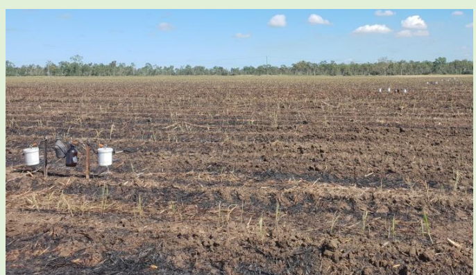
Re-installing water quality monitoring equipment at a recently harvested ratoon block.

Over the past few months, we have been very busy with compiling results and writing annual reports as the 2019/2020 sampling period has come to a close – Luckily most of that work could be undertaken from home during the Covid-19 lockdown period! Now that we are back in the office, it is time to start reinstrumenting sites in preparation for what is expected to be a busy sampling season for 2020/2021.