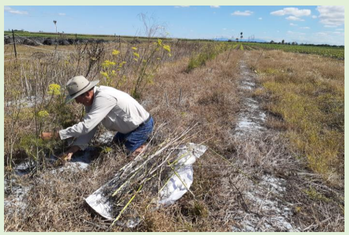
Dennis harvesting the fennel.

The purpose of this spice trial is to determine the suitability of these condiment crops for the conditions in the tropics, and develop a reliable market should the crops be appropriate in local conditions.